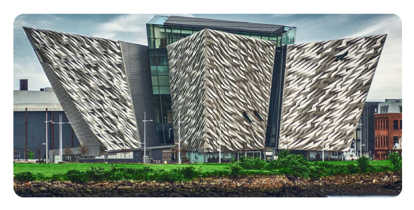
Note that the itinerary can change due to weather conditions, traffic, events, etc.

Note: Due to the limited availability and popularity of Newgrange, we cannot guarantee a booking to this specific site. This may be exchanged for Knowth or Hill of Tara