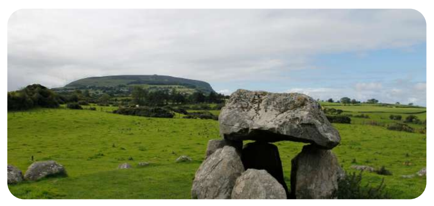
Note that the itinerary can change due to weather conditions, traffic, events, etc.