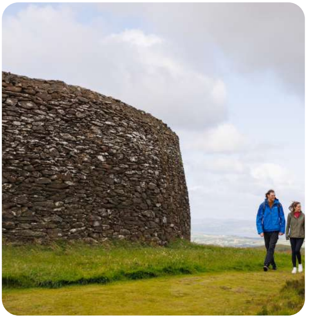
Note that the itinerary can change due to weather conditions, traffic, events, etc.