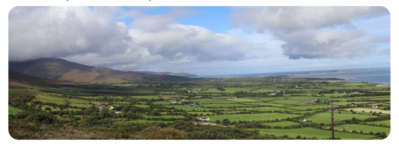
Note that the itinerary can change due to weather conditions, traffic, events, etc.

Tonight spend the evening indulging in some Irish music and craic! You will stay overnight in either Doolin, with its colourful houses and buckets of charm, or Spanish Point, a spectacular coastal location.