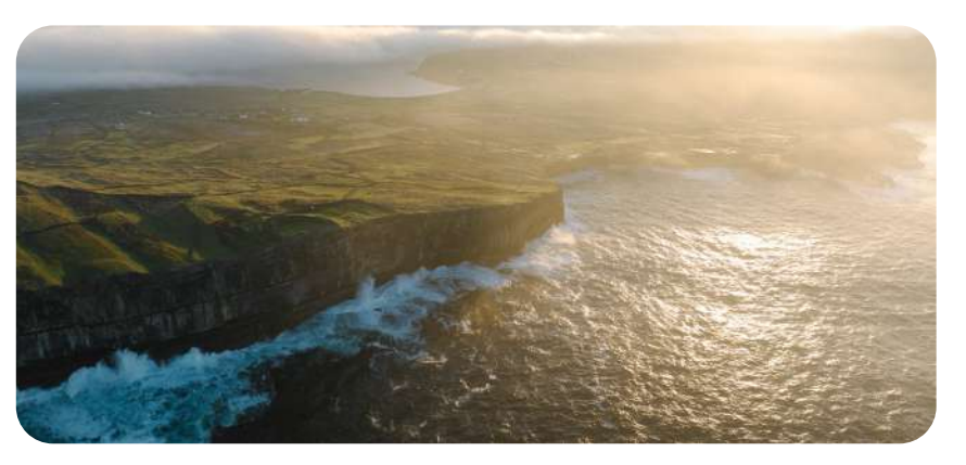
Note that the itinerary can change due to weather conditions, traffic, events, etc.