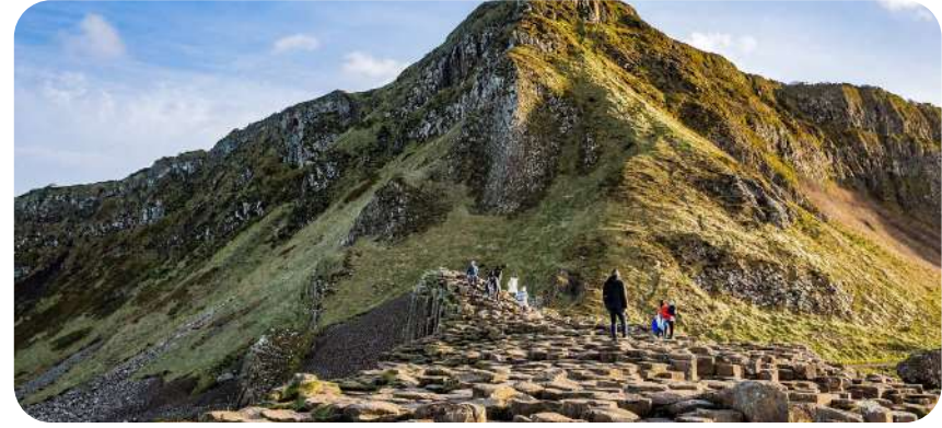
Note that the itinerary can change due to weather conditions, traffic, events, etc.