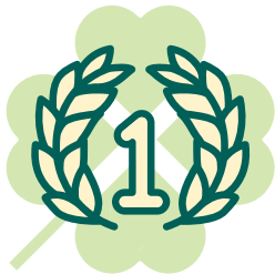
Award Winning Company

We have designed every aspect of our Ireland vacations to ensure maximum enjoyment on the road. You can confidently book a trip with us knowing that you will have a trip of a lifetime.