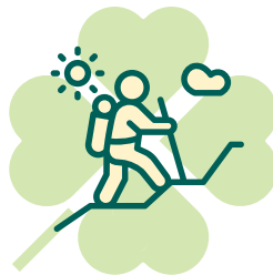
The Great Outdoors