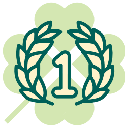
Award Winning Company

We have designed every aspect of our Ireland vacations to ensure maximum enjoyment on the road. You can confidently book a trip with us knowing that you will have a trip of a lifetime.