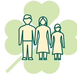
Small Group Sizes