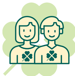
Experienced Providers & Suppliers