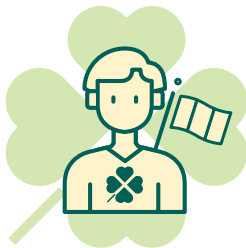
Irish Tour Guides