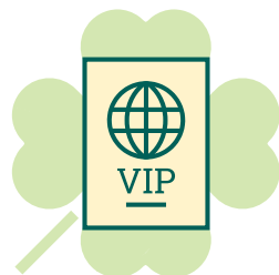
Private Tour Options