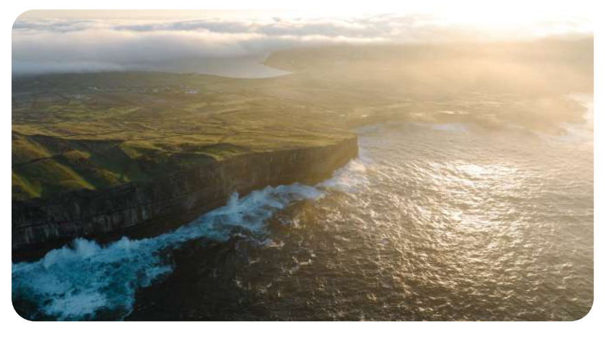
Note that the itinerary can change due to weather conditions, traffic, events, etc.