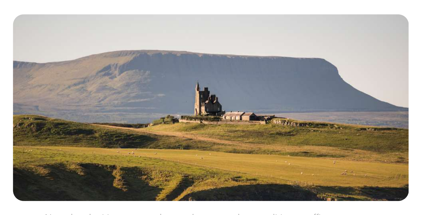
Note that the itinerary can change due to weather conditions, traffic, events, etc.

Conclude your day at the breathtaking Lough Eske Castle, where you'll get to live like royalty during a luxurious overnight stay! This historic landmark has been lovingly restored to its former glory and is surrounded by tranquil waters and ancient woodlands.