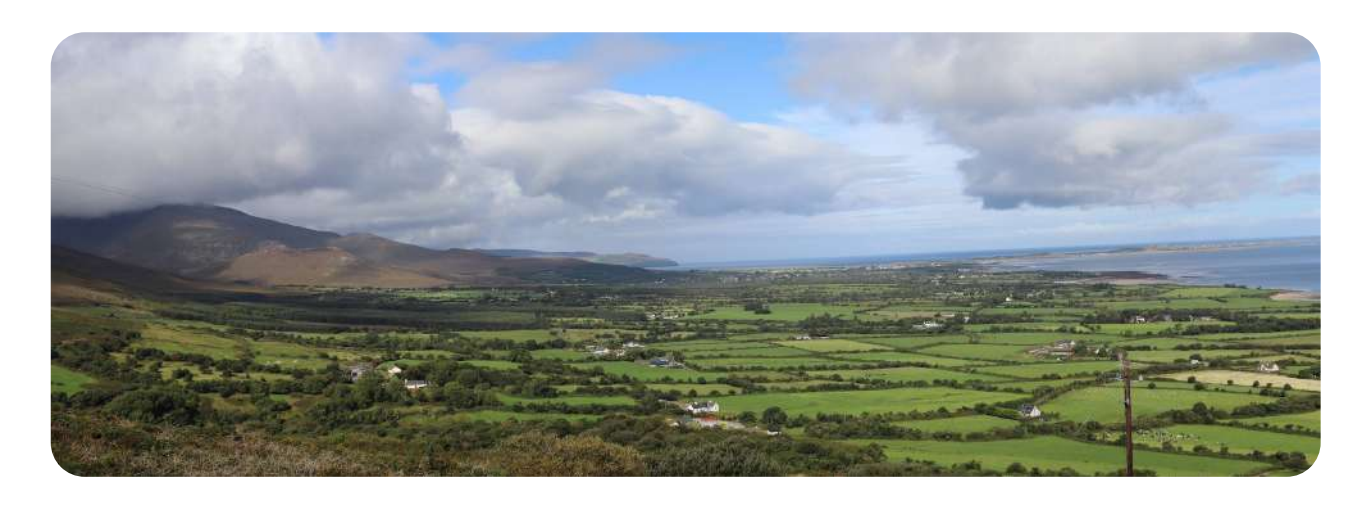
Note that the itinerary can change due to weather conditions, traffic, events, etc.

Tonight spend the evening indulging in some Irish music and craic! You will stay overnight in either Doolin, with its colorful houses and buckets of charm, or Spanish Point, a spectacular coastal location.