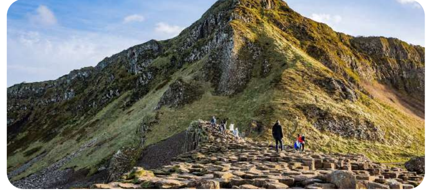
Note that the itinerary can change due to weather conditions, traffic, events, etc.