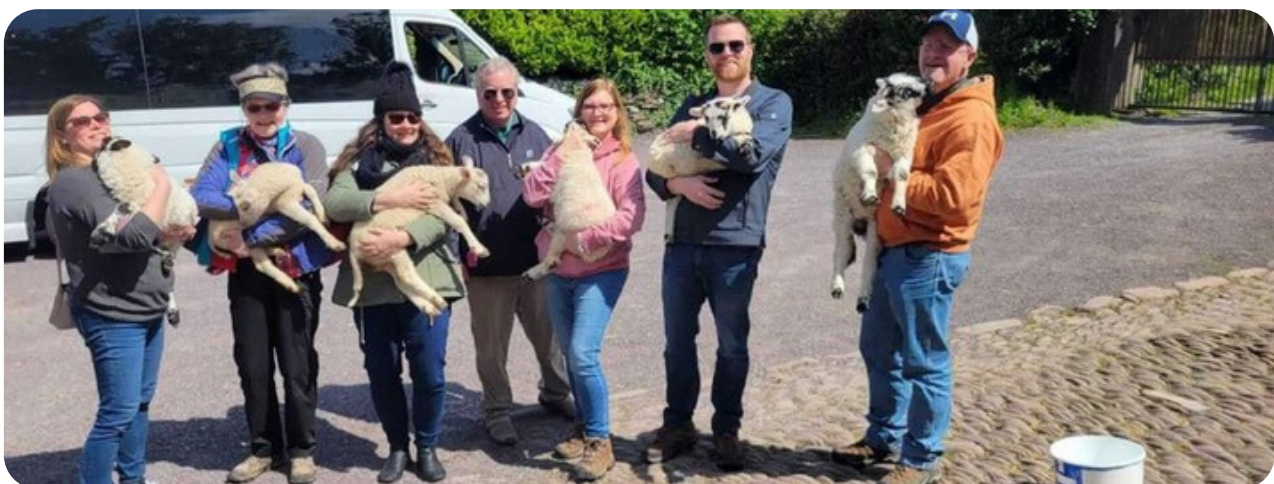
Note that the itinerary can change due to weather conditions, traffic, events, etc.

And this is only day one, your journey around Ireland is just beginning, with many unforgettable experiences still ahead!