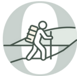
The Great Outdoors