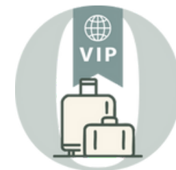
Private Tour Options