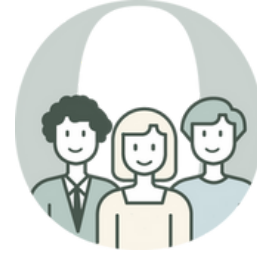
Small Group Sizes