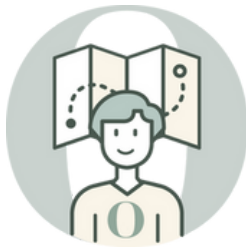
Irish Tour Guides