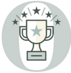
Award Winning Company

We have designed every aspect of our Ireland vacations to ensure maximum enjoyment on the road. You can confidently book a trip with us knowing that you will have a trip of a lifetime.