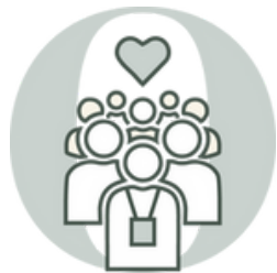
Experienced Providers & Suppliers